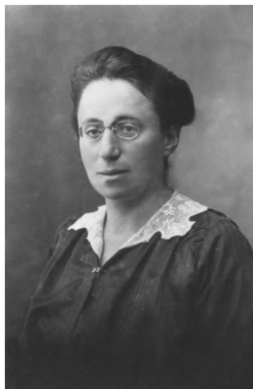
Figure bio.5: Emmy Noether

Emmy Noether (NER-ter) was born in Erlangen, Germany, on March 23, 1882, to an upper-middle class scholarly family. Hailed as the “mother of modern algebra,” Noether made groundbreaking contributions to both mathematics and physics, despite significant barriers to women’s education. In Germany at the time, young girls were meant to be educated in arts and were not allowed to attend college preparatory schools. However, after auditing classes at the Universities of Göttingen and Erlangen (where her father was professor of mathematics), Noether was eventually able to enrol as a student at Erlangen in 1904, when their policy was updated to allow female students. She received her doctorate in mathematics in 1907.