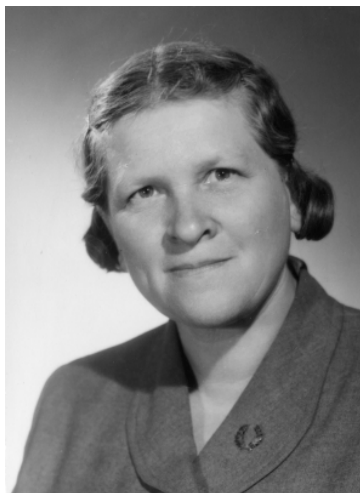
Figure bio.6: Rózsa Péter

Péter was known as a passionate teacher of mathematics, who preferred to explore the nature and beauty of mathematical problems with her students rather than to merely lecture. As a result, she was affectionately called “Aunt Rosa” by her students. Péter died in 1977 at the age of 71.