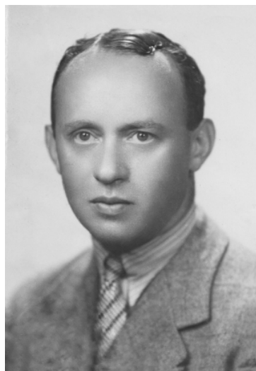
Figure bio.9: Alfred Tarski

His work on logical consequence and logical truth were written during this time. In 1939, Tarski was visiting the United States for a lecture tour. During his visit, Germany invaded Poland, and because of his Jewish heritage, Tarski could not return. His wife and children remained in Poland until the end of the war, but were then able to emigrate to the United States as well. Tarski taught at Harvard, the College of the City of New York, and the Institute for Advanced Study at Princeton, and finally the University of California, Berkeley. There he founded the multidisciplinary program in Logic and the Methodology of Science. Tarski died on October 26, 1983 at the age of 82.