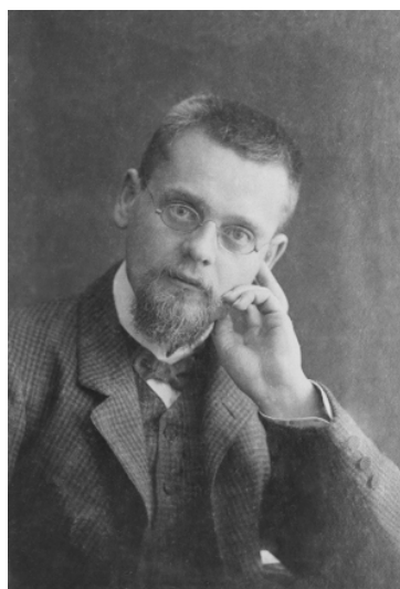
Figure bio.11: Ernst Zermelo

The later years of Zermelo’s life were marked by isolation. After his dismissal in 1935, he abandoned mathematics. He moved to the country where he lived modestly. He married in 1944, and became completely dependent on