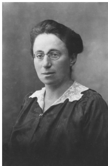
Figure bio.5: Emmy Noether

Emmy Noether (NER-ter) was born in Erlangen, Germany, on March 23, 1882, to an upper-middle class scholarly family. Hailed as the “mother of modern algebra,” Noether made groundbreaking contributions to both mathematics and physics, despite significant barriers to women’s education. In Germany at the time, young girls were meant to be educated in arts and were not allowed to attend college preparatory schools. However, after auditing classes at the Universities of Göttingen and Erlangen (where her father was professor of mathematics), Noether was eventually able to enroll as a student at Erlangen in 1904, when their policy was updated to allow female students. She received her doctorate in mathematics in 1907.