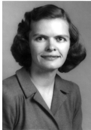
Figure bio.7: Julia Robinson

Interested in decision problems, Robinson next attempted to find a solution Hilbert's tenth problem. This problem was one of a famous list of 23 mathematical problems posed by David Hilbert in 1900. The tenth problem