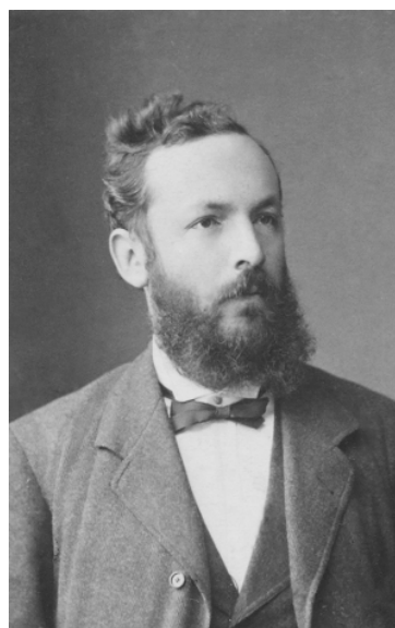
Figure bio.1: Georg Cantor

Cantor died on January 6, 1918, in a sanatorium in Halle.