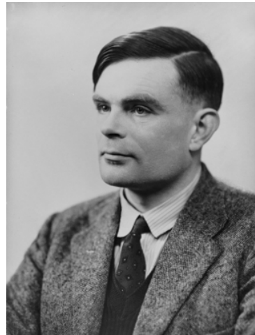
Figure bio.10: Alan Turing

Turing attended King's College, Cambridge as an undergraduate, where he studied mathematics. In 1936 Turing developed (what is now called) the Turing machine as an attempt to precisely define the notion of a computable function and to prove the undecidability of the decision problem. He was beaten to the result by Alonzo Church, who proved the result via his own lambda calculus. Turing's paper was still published with reference to Church's result. Church invited Turing to Princeton, where he spent 1936–1938, and obtained a doctorate under Church.