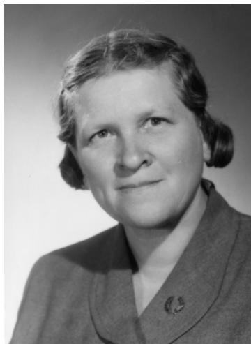
Figure bio.6: Rózsa Péter

Péter's early papers are widely credited as founding contributions to the field of recursive function theory. In Péter (1935a), she investigated the relationship between different kinds of recursion. In Péter (1935b), she showed that a certain recursively defined function is not primitive recursive. This simplified an earlier result due to Wilhelm Ackermann. Péter's simplified function is what's now often called the Ackermann function—and sometimes, more properly, the Ackermann-Péter function. She wrote the first book on recursive function theory (Péter, 1951).