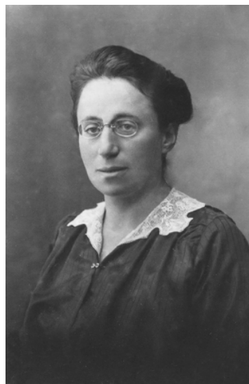
Figure bio.5: Emmy Noether

Emmy Noether (NER-ter) was born in Erlangen, Germany, on March 23, 1882, to an upper-middle class scholarly family. Hailed as the “mother of modern algebra,” Noether made groundbreaking contributions to both mathematics and physics, despite significant barriers to women’s education. In Germany at the time, young girls were meant to be educated in arts and were not allowed to attend college preparatory schools. However, after auditing classes at the Universities of Göttingen and Erlangen (where her father was professor of mathematics), Noether was eventually able to enrol as a student at Erlangen in 1904, when their policy was updated to allow female students. She received her doctorate in mathematics in 1907.