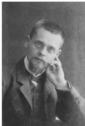
Figure bio.11: Ernst Zermelo

The later years of Zermelo’s life were marked by isolation. After his dismissal in 1935, he abandoned mathematics. He moved to the country where he lived modestly. He married in 1944, and became completely dependent on