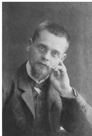
Figure bio.11: Ernst Zermelo

The later years of Zermelo’s life were marked by isolation. After his dismissal in 1935, he abandoned mathematics. He moved to the country where he lived modestly. He married in 1944, and became completely dependent on