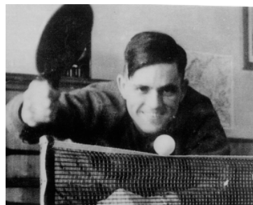
Figure bio.3: Gerhard Gentzen

Gerhard Gentzen is known primarily as the creator of structural proof theory, and specifically the creation of the natural deduction and sequent calculus proof systems. He was born on November 24, 1909 in Greifswald, Germany. Gerhard was homeschooled for three years before attending preparatory school, where he was behind most of his classmates in terms of education. Despite this, he was a brilliant student and showed a strong aptitude for mathematics. His interests were varied, and he, for instance, also wrote poems for his mother and plays for the school theatre.