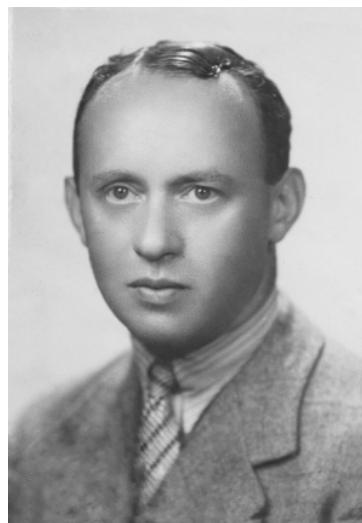
Figure bio.9: Alfred Tarski

Tarski had a thirst for knowledge from a young age. Although later in life he would tell students that he studied logic because it was the only class in which he got a B, his high school records show that he got A's across the board—even in logic. He studied at the University of Warsaw from 1918 to 1924. Tarski first intended to study biology, but became interested in mathematics, philosophy, and logic, as the university was the center of the Warsaw School of Logic and Philosophy. Tarski earned his doctorate in 1924 under the supervision of Stanisław Leśniewski.